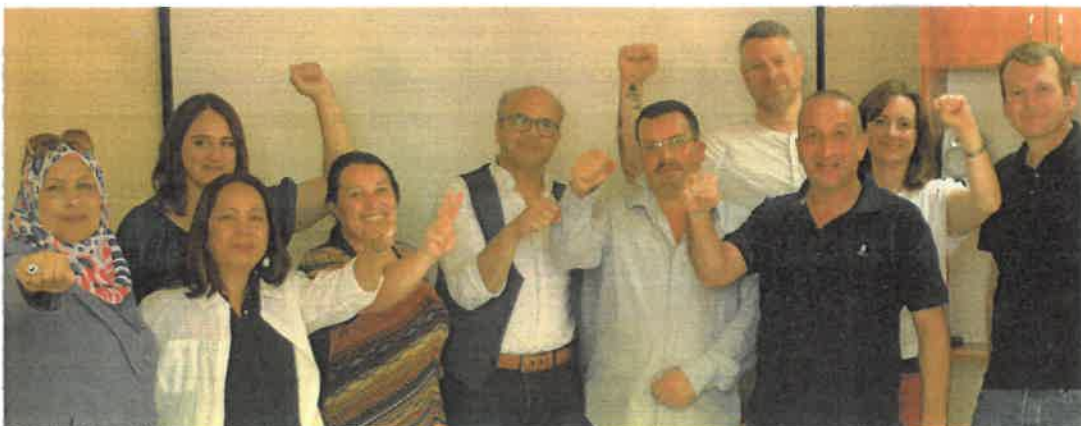
Palestinian union leaders meeting with CUPE's delegation at the Democracy and Workers' Rights Centre in Ramallah, Occupied Palestinian Territories.